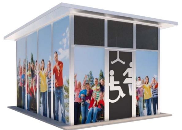
Premium Finish – Graphic Aluminium composite panels with vinyl graphic and anti-graffiti coating