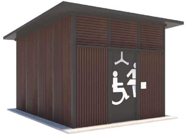
Premium Finish – WPC Wood Plastic Composite battens