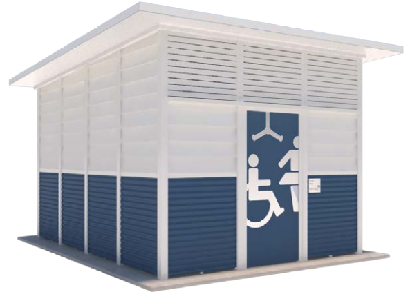
Standard Finish Colorbond (lower) and aluminium cladding (upper)

Stakeholders will have the peace of mind that they are investing in an asset that is tried and proven all around Australia.